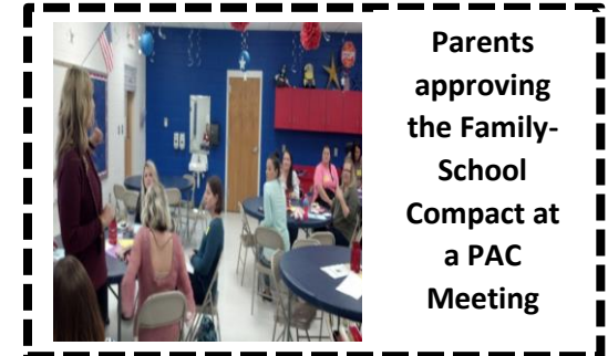
Parents approving the Family- School Compact at a PAC Meeting